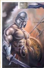
Uber - Alpha