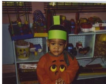
Was my little man cute or what? In case you can't tell, he was a pumpkin. (at age - 3 yrs.)

This upcoming week promises to be a interesting one, as I am celebrating my birthday on Thursday, then I'm driving down to Cleveland, OH on Friday to do a book signing at the Borders Express in The Tower City Ctr. So, if you're in the Cleveland area, drop by and say hello! Well, that's all the news for now, but I hope you'll read and enjoy His Holiday Bride , and as always I'd love to hear your thoughts on it. Until, next time . . .