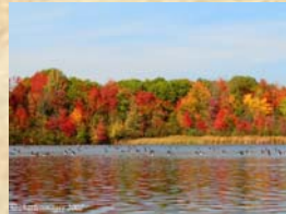
Fox River in the U.P.