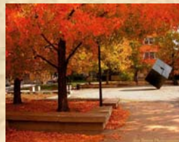
U of M - Ann Arbor

Is it just my imagination or did the creators of the Snuggie have a little inter-galactic inspiration? Hmmmm . . .